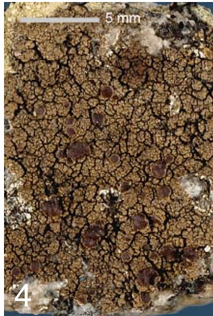
Figures: 1. Cryptothecia queenslandica (holotype in BRI); 2. Dirinaria sekikaica (holotype in CANB); 3. Felthanera tropica (isotype in CANB); 4. Protoparmelia rogersii (holotype in BRI).